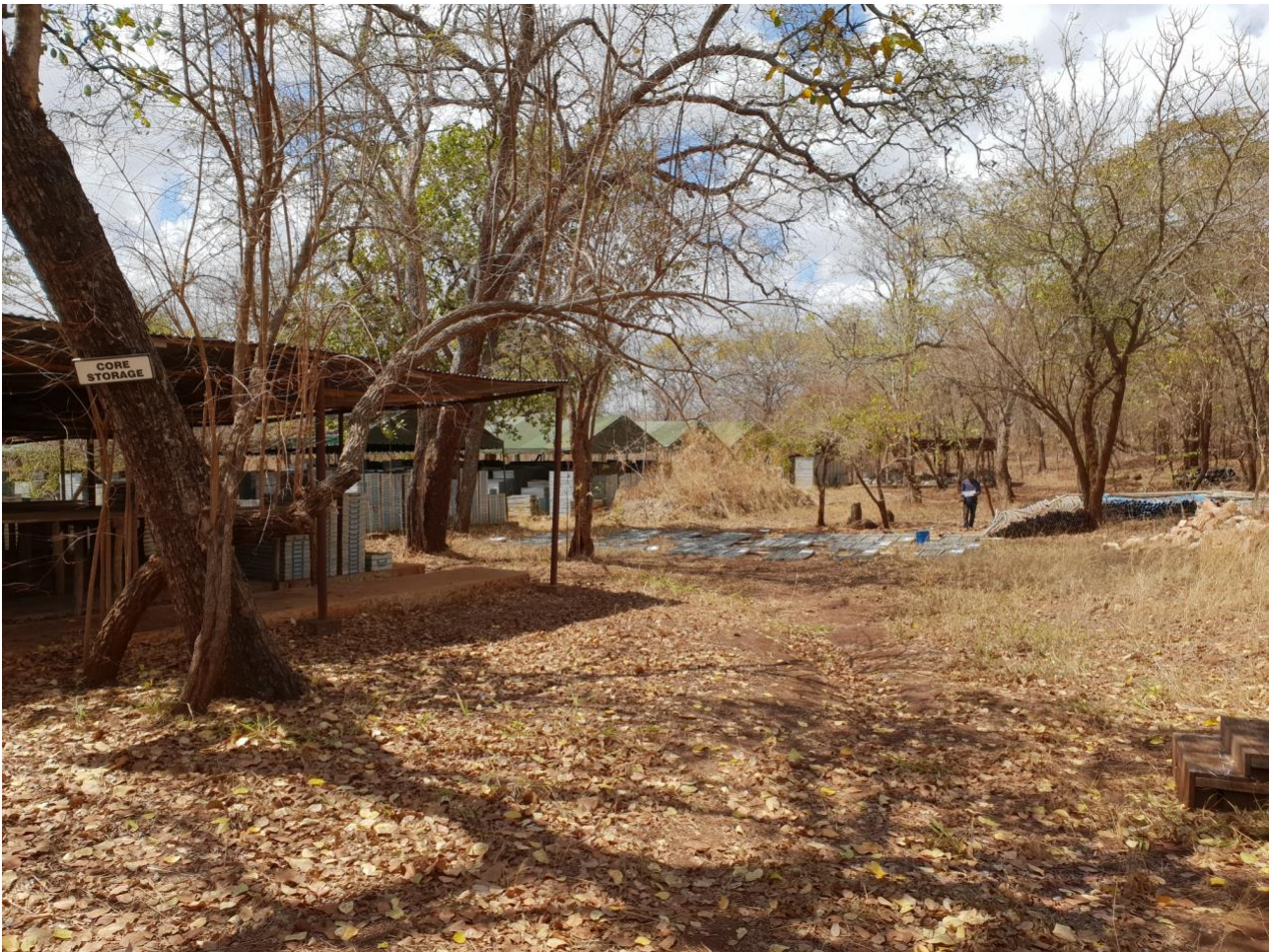
Figure 3. Ntaka Hill camp offices