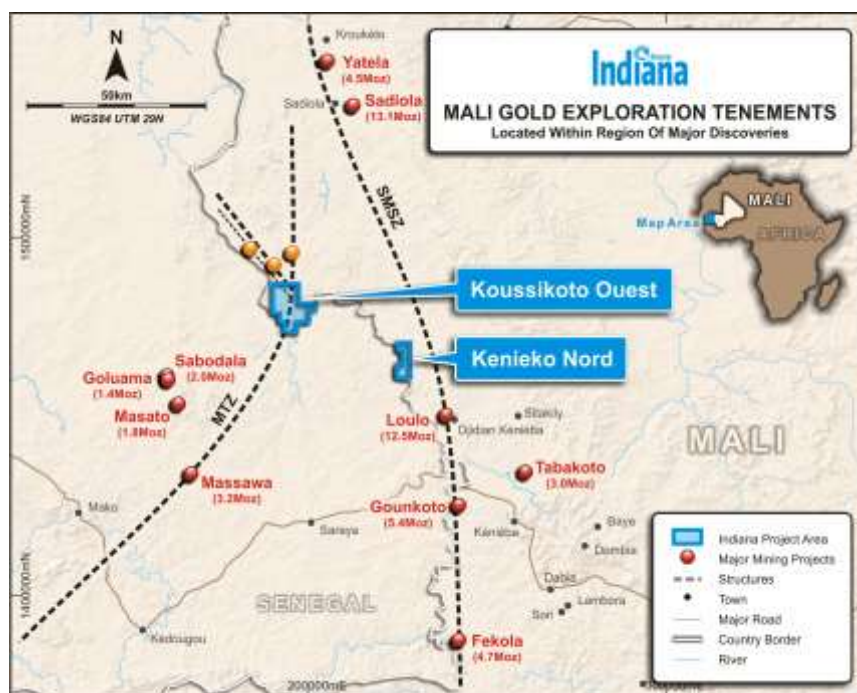
Figure 1 – Indiana project areas, west Mali

At Koussikoto, drilling comprised 150 holes for 3,967m and focused on priority geochemical and structural targets along the 10km MTZ within the central portion of the Project area (Figure 2). At Kenieko, 19 holes for 358m were drilled, targeting a recently identified artisanal gold mining trend in the north of the project area. Samples have been submitted to the laboratory, with analytical results expected at the end of June. This data will be used to plan the next phase of exploration activity, which is expected to commence following the end of the rainy season in October.