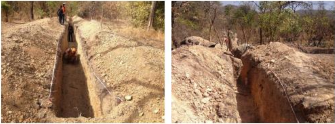
Figure 2 – Koussikoto trenching