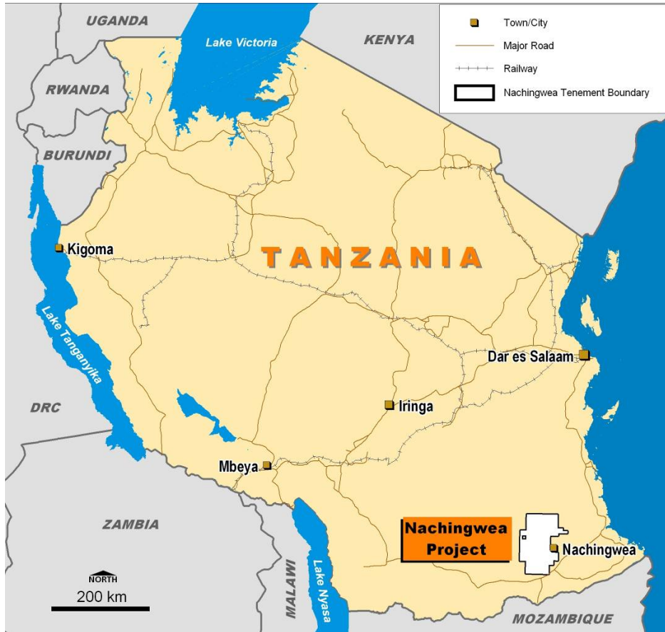
Location of the Nachingwea Project